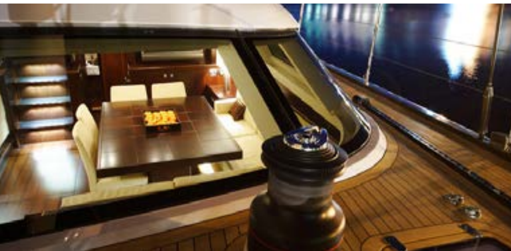
FROM THE GUEST BOOK

It has been the best week of our lives! A big thank to the Captain and to the most amazing crew for an outstanding experience. - Sicily, August 2023 -